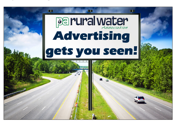
Join PRWA as an associate member today to begin receiving all of these benefits!

SOURCEBOOK LISTING: The PRWA Sourcebook is a resource for our member systems and associates to find consultants, engineers, parts suppliers, and specialty services in their area. Associate Members that choose to be included will be displayed in our digital index of industry colleagues. Whether you are looking for a hard to find part, or the best prices available, the PRWA Sourcebook should be your first stop!